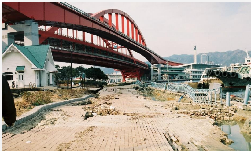
Damage to Kobe Ohashi Bridge during 1995 Hyogoken-Nambu earthquake